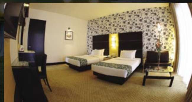
Doze...in your sanctuary.

EASTWOOD VALLEY GOLF & COUNTRY CLUB Lot 1379, Bock 17, KBLD, 98000 Miri, Sarawak, Malaysia Tel: +6085-421 010 Fax: +6085-430 515 H/P: +016-577 6667 Email: info@eastwoodvalley.com Website: www.eastwoodvalley.com