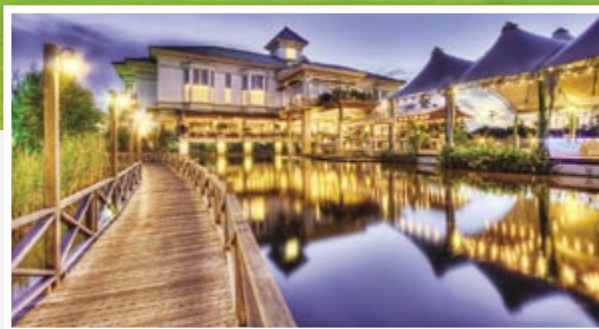
Eastwood Valley Golf & Country Club.