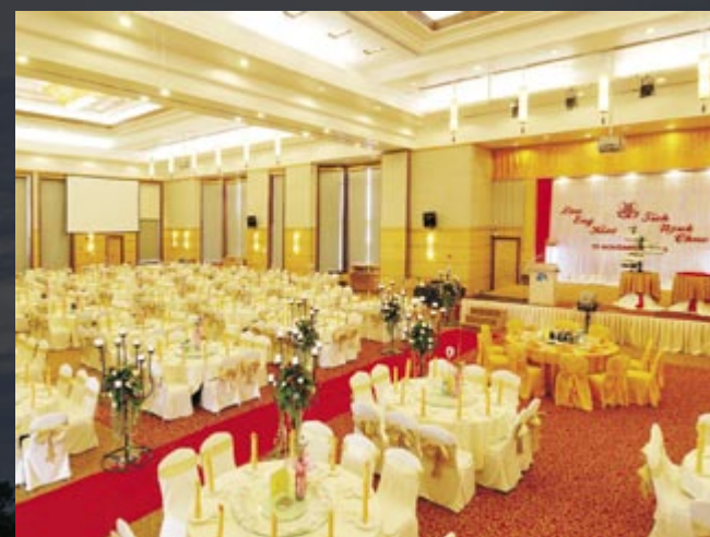
Enter...to World Class Standards.

Welcome to Eastwood Valley Golf & Country Club. Welcome to Nature.